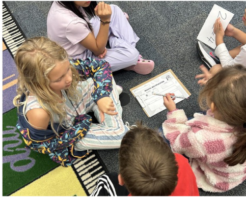
3rd Grade Connecting Music And Math