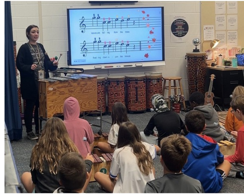
5th Grade Playing Orff Instruments